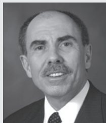
President, Alliance for Excellent Education Former Governor of West Virginia

I've been working on literacy for five years, ever since joining the Alliance for Excellent Education. Literacy is critical to education reform and the Alliance recognized early on that it was an undeveloped area at both the federal and state level.